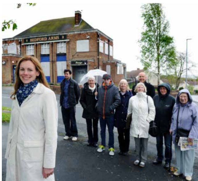
OPAL outside their newly purchased Bedford Arms.

OPAL has used the £10,500 grant to purchase the leasehold on the Bedford Arms pub in the Silk Mills area of Leeds. Both the Inner West and Outer North West community committees have given a total of £15,000 wellbeing funding towards the costs of refurbishing the building to develop the new community centre.