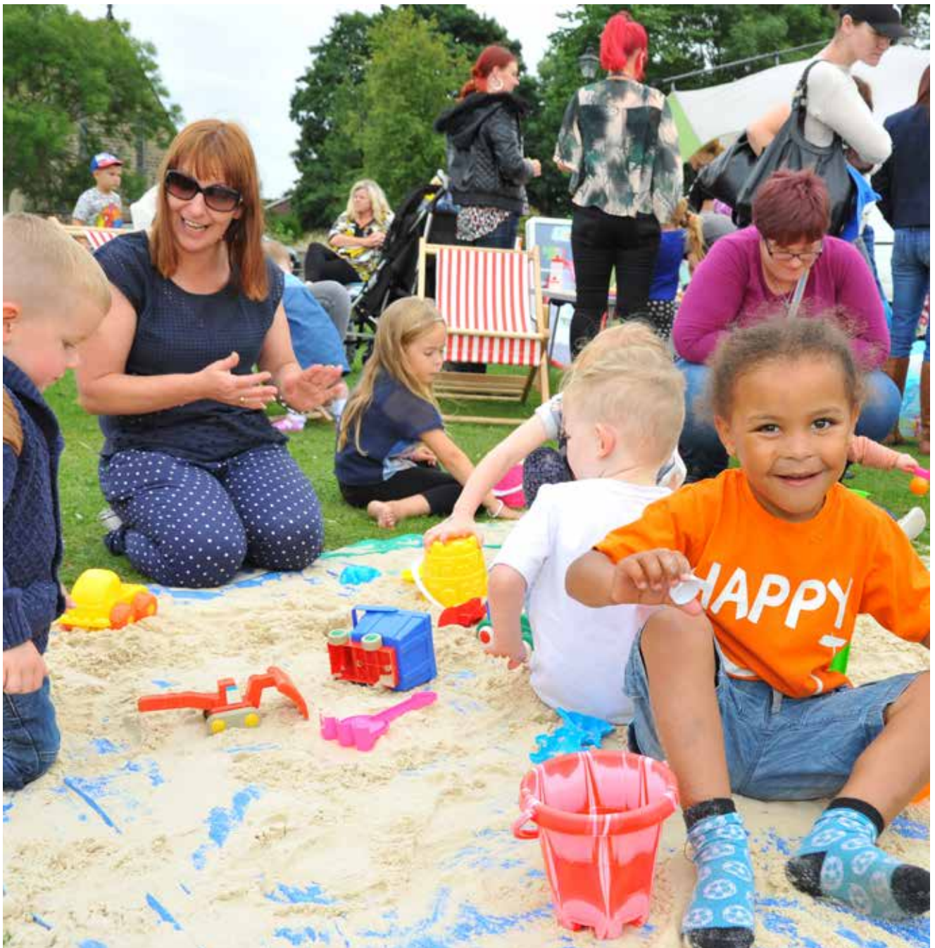
Seacroft gala show.

In Inner South the engagement strategy has focussed on specific pieces of work, with the lead being taken by neighbourhood improvement officers, funded from wellbeing money. One example is the Middleton Skate Park, developed by Middleton Youth Partnership in response to demands from young people living in the area. There was consultation with young people and residents on the need for a skate park as well as its design, which influenced the brief and tender specification. In depth consultation and involvement with young people helped to secure funding from a number of sources to develop the project at a cost of around £100,000.