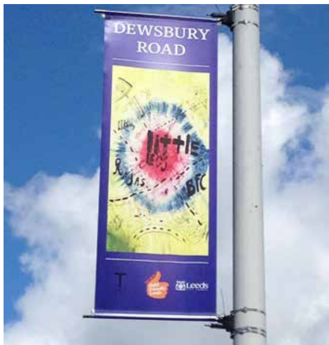
Local school designed streetlight banners for Dewsbury Road.