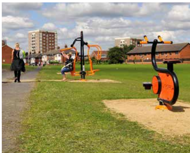
Fitness equipment at Ley Lane.

Feedback from the discussion groups recommended focussing on the basics to create safe and clean recreation spaces for people to enjoy, such as improving paths, providing more bins and non-traditional imaginative play, rather than the usual swings and slides. A number of options are being considered to promote the health and wellbeing benefits of volunteering outdoors.