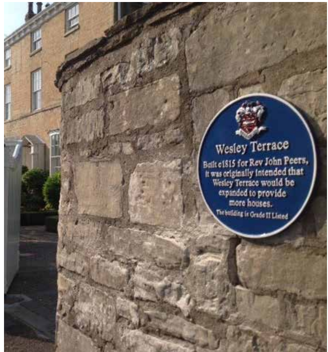
Boston Spa Parish Council heritage trail.

The Outer North East Community Committee has also supported a number of parish council projects using its wellbeing funding, such as £1,780 to Boston Spa Parish Council to build and promote a heritage trail using blue plaque type signage and an associated guide.