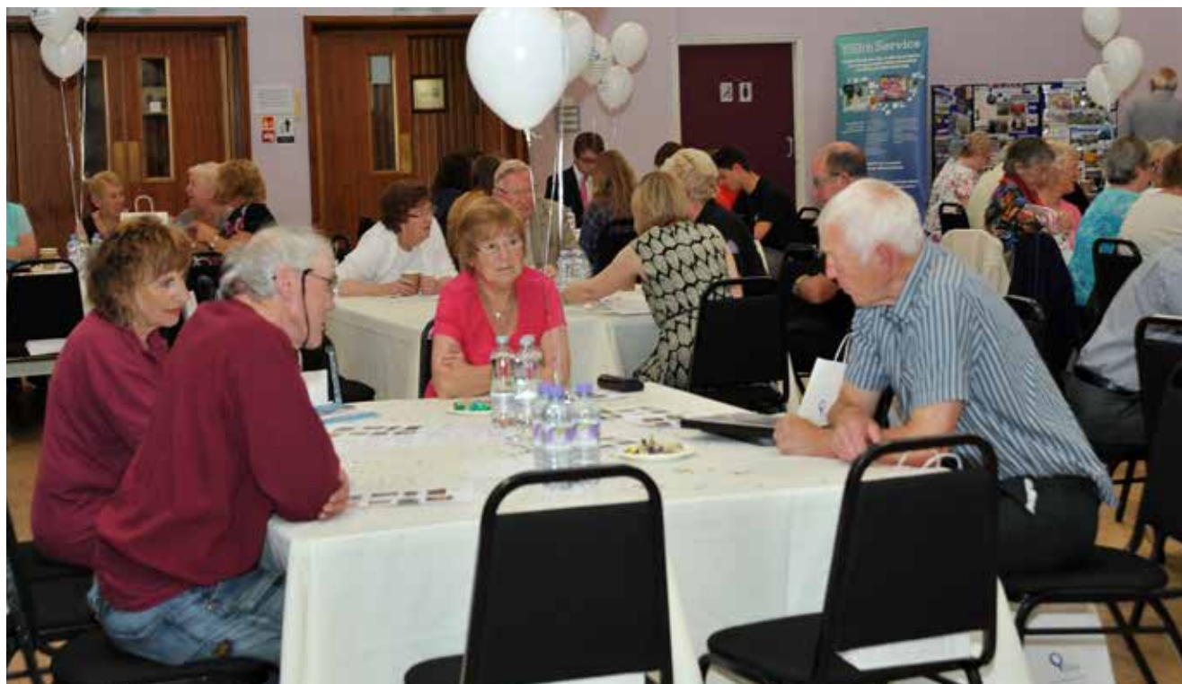
Community heroes event 2015.

Good partnership working between the community committees and parish and town councils presents an additional opportunity to achieve the council's ambition to achieve a substantial and lasting shift towards local democracy. By working closely together, the community committees and parish and town councils make a vital contribution to the wellbeing of the communities they serve. A charter www.leeds.gov.uk/docs/TheLeedsParishandTownCouncilCharter sets out how the community committees and the parish and town councils work together for the benefit of local people.