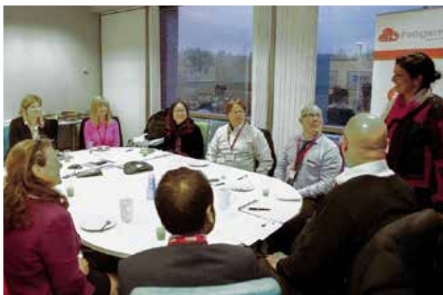
Ahead Partnership project meeting.

The Outer West Community Committee held its first themed meeting on delivering actions, which drive business enterprise, the local economy, and quality learning and employment opportunities.