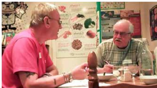
Chapelton conversation dinner.

https://www.youtube.com/watch?v=uUJDUR5b5DM