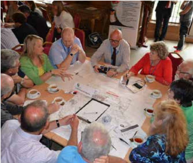
Community committee meetings.