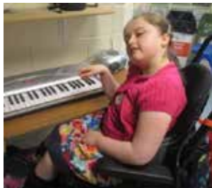
Aireborough Supported Activities Scheme.

The Outer North West Community Committee continues to support a project for children and young people with disabilities through their wellbeing fund. The Aireborough Supported Activities Scheme provides a range of activities including learning circus skills, swimming, trips to the cinema, sailing at Yeadon Tarn and environmental projects at Herd Farm for young people living in the north west of Leeds.