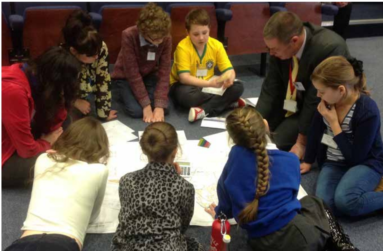
Young people discussing youth activities.