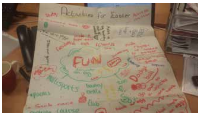
Ideas for youth activities.

A number of key themes emerged from both these workshops, including engaging with young people in settings they are comfortable with, using social media to publicise activities, and providing a mechanism for young people to put forward ideas and represent their community.