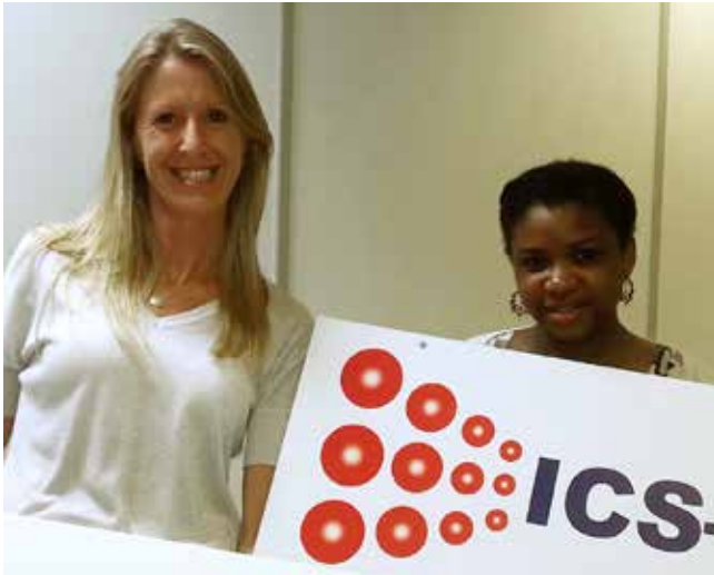
Our apprentice with her new employer.