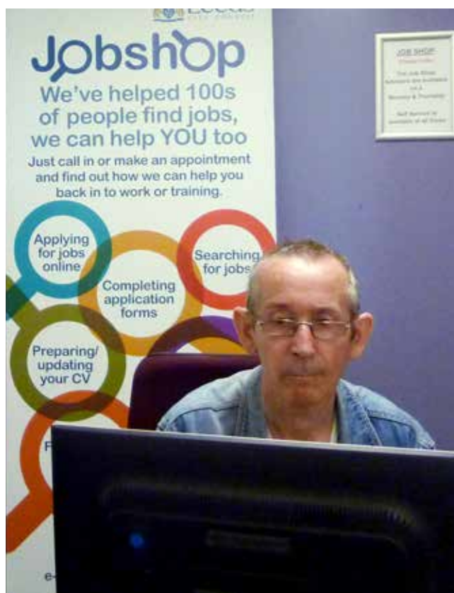
St George's One Stop Centre.