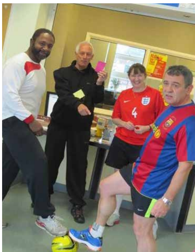
Members of the over 50's walking football club.

Over 50's walking football club – £2,564.52 from the Outer West Community Committee. The project has allowed older residents to rediscover the joys of playing football again through a sport, which is safe, enjoyable and has numerous health benefits.