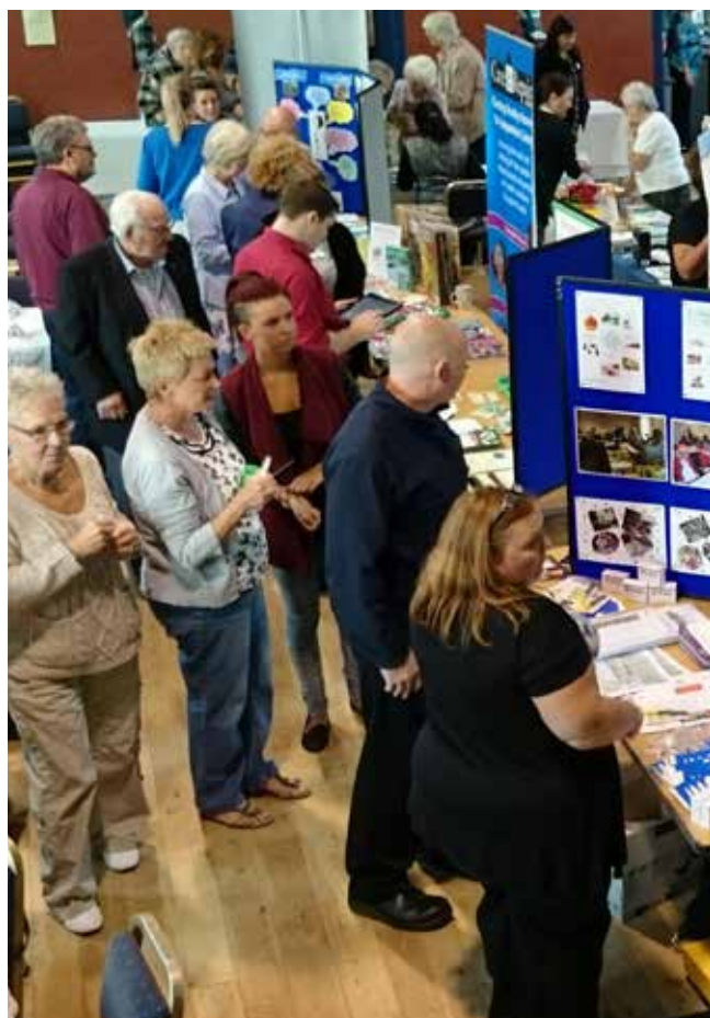
Older persons' event.

Coinciding with the International Day of Older People on 1 October 2014, the fourteenth older persons' event week was held throughout the Outer East area. Activities included a meet-and-greet with the Lord Mayor, sing-alongs and stalls from many groups including the Fire Service, Police, Green Doctor and Lloyd's health checks. Held at a different venue each day, events took place in Great Preston, Swarcliffe, Cross Gates, Halton, Halton Moor, Garforth and Kippax. Approximately 450 residents attended, enabling socially isolated older people to discover activities to give a positive impact on their health and wellbeing. Similar events were held in the Outer and Inner South areas, attracting around 500 older people.