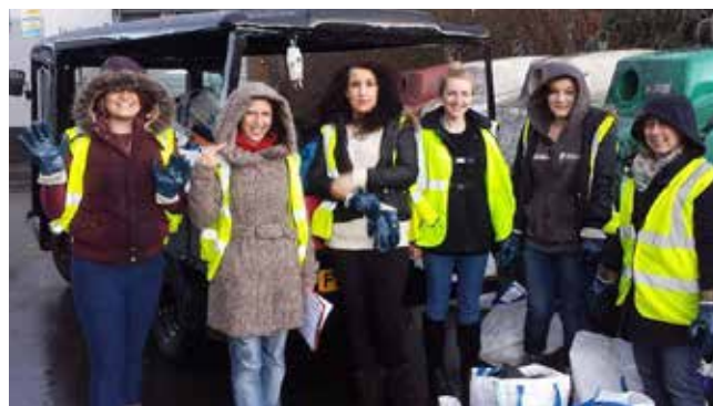
Students from the university helping during the changeover period.

The community committee also worked with Leeds Beckett's University Students' Union to develop a new project, which will aim to boost volunteering around changeover time to address environmental issues in the area; the community committee has allocated just over £5,000 for this project.