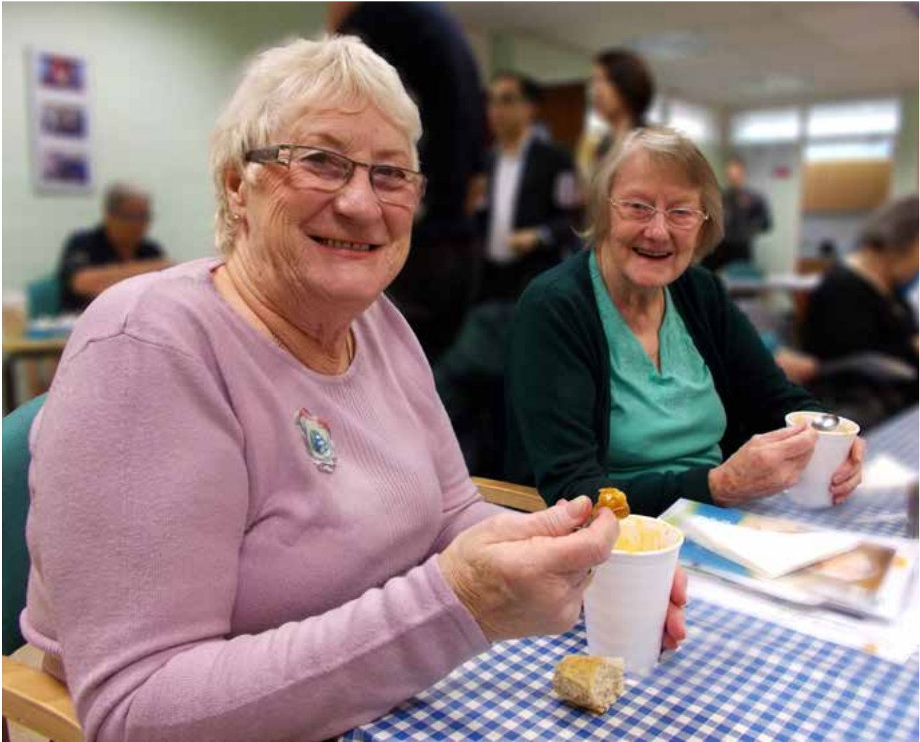
Social isolation – winter warmer lunch.

At the Inner West Community Committee's workshop on mental health, community committee members, health partners, service users and residents discussed the issues, particularly focussing on how to engage with people who feel isolated.